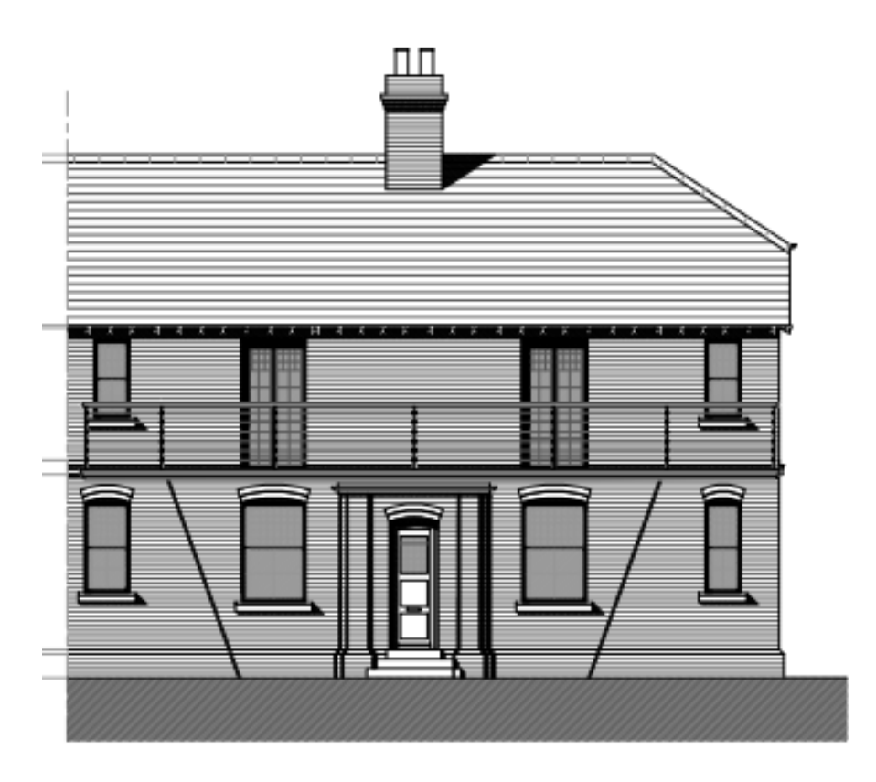
Figure 2 – Proposed Front elevation

2.7 The proposed balcony as shown on Figures 2 and 3, would be at first floor level, together with the change to the fenestration to support the balcony. The size and scale of the proposed balcony would be similar to others present within the row of properties. The design is light in construction and would not be visually intrusive to property. The balcony is considered to acceptable and would not create an unacceptable change to the front elevation.